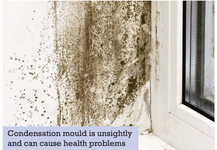
Condensation mould is unsightly and can cause health problems

Newly built homes can sometimes feel damp because the water used during construction (in cement, plaster etc) is still drying out.